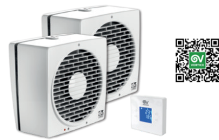
AXIAL EXTRACTOR FANS FOR WALL/GLASS INSTALLATION WITH CO 2 SENSOR