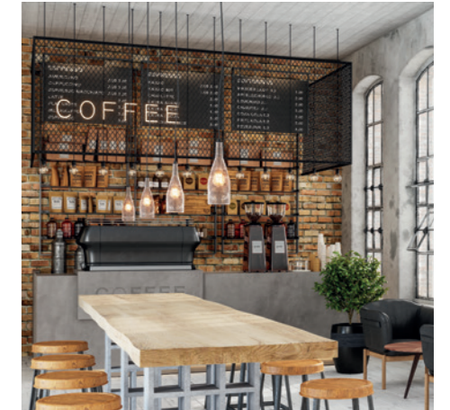
Restaurants, bars and canteens