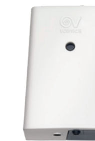
SOAP AND GEL DISPENSERS

VORT SUPER DRY Range is composed of automatic electric hand dryers with UV germicidal lamp. They dry and sanitise the hands without the need to touch anything. Maximum hygiene and safety for the user.