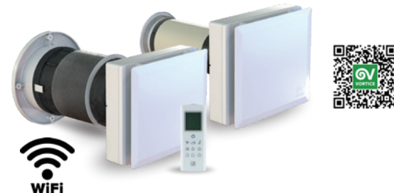
DECENTRALISED HEAT RECOVERY UNITS

VARIO-CO 2 KIT is a ventilation system that ensures the rapid exchange of ambient air in relation to the concentration of carbon dioxide (CO 2 ) detected by a special sensor, thus ensuring adequate oxygenation rates, avoiding the accumulation of carbon dioxide and preventing the concentration of pathogens resulting from the metabolism of the occupants.