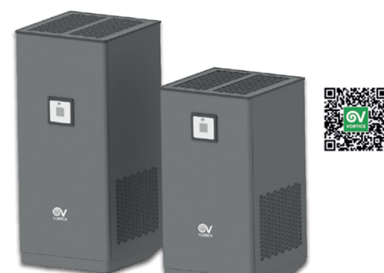
AIR PURIFIERS WITH HEPA H14 FILTERS AND PHOTOCATALYSIS MODULE

VORTRONIC Range is composed of air purifiers + ionisers suitable for environments up to 200 m 3 . They are able to eliminate up to 98% of the pathogens in the air, such as pollen and microparticles, which are potential carriers of viruses and bacteria.