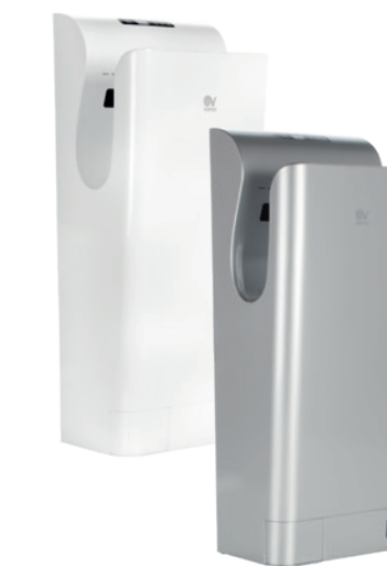
AUTOMATIC HAND DRYERS