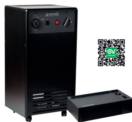
PURIFIERS + IONISERS