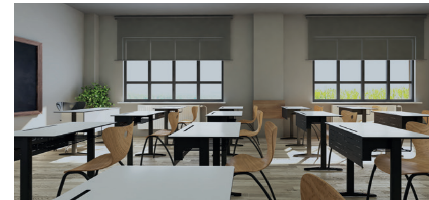
Universities, schools and kindergartens