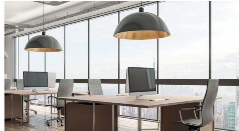
Offices, meeting rooms and professional studios